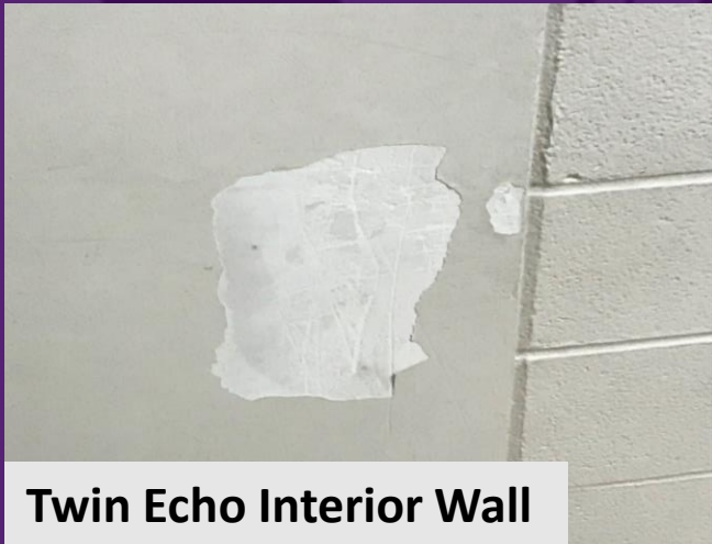
Twin Echo Interior Wall