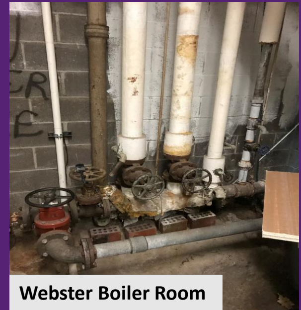
Webster Boiler Room