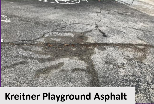
Kreitner Playground Asphalt