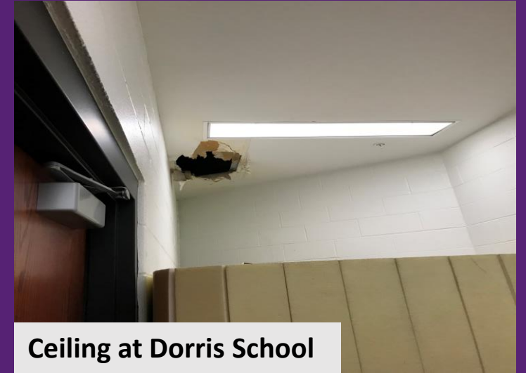
Ceiling at Dorris School