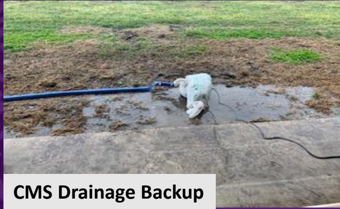
CMS Drainage Backup