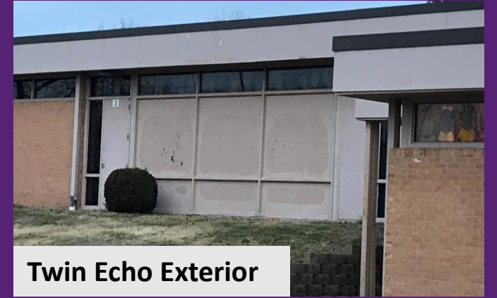
Twin Echo Exterior